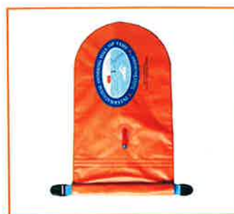
3. Fold again.