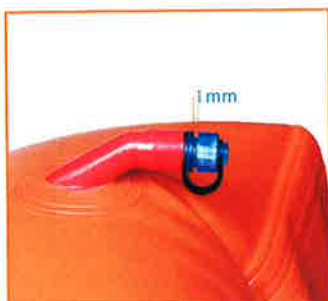
8. Relax the valve cap about 1mm to deflate.