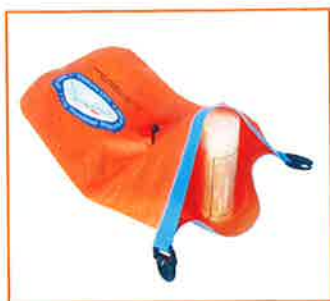
1. Loaded with goods.

The ISHOF SaferSwimmer™ is a lightweight inflatable, dry bag device that visibly floats behind a swimmer in open bodies of water. The device is easily pulled along by the swimmer and can hold one's valuables (e.g., wallet, money, mobile phone, shoes, towel) as well as be used in emergencies as a flotation device. The brightly colored device is also easily visible by lifeguards and boaters and windsurfers on the water. For proper use, follow these instructions and see the video clip on www.ishof.org