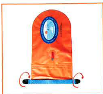
2. Fold over the blue stripe.