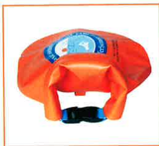
5. Attached the clips together.