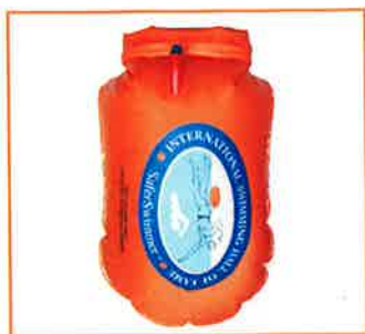
7. Re-screw the valve cap.