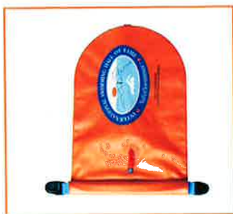
4. Fold a total of 4 times.