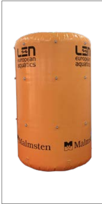
1310013 Open water buoy - Large