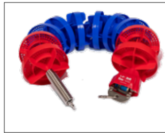
1010002 Racing Lane Line Malmsten Gold Ø 150 m