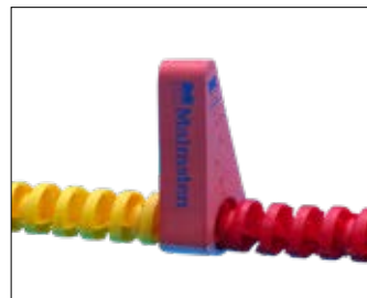
1514021 Cones – Field Line