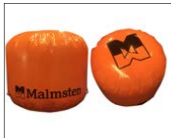
1310014 Open water buoy - Smal