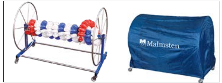
1012001 Storage Trolley for Lane Line Malmsten 1050006 Cover for Malmsten Storage Trolley