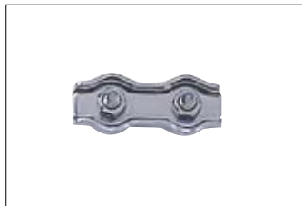
1011011 Wire lock